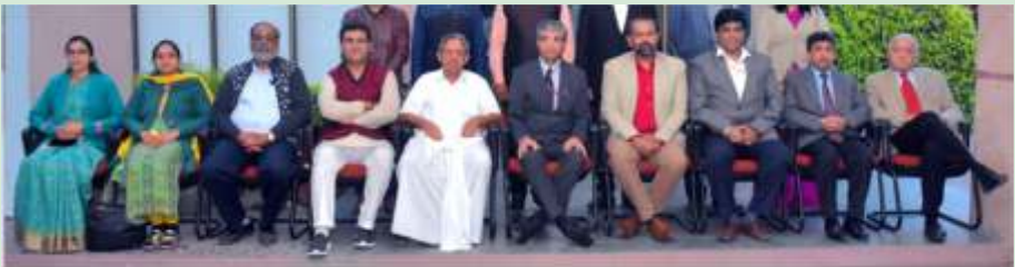
Board Members of Yoga Certification Board (YCB)

Yoga Certification Board is established for certification of Yoga professionals and accreditation of Yoga Institutions, prescribing syllabus for various levels of Yoga trainers and other such activities that may be considered necessary for promotion of Yoga. Professional assessment of these service providers are carried out so as to certify the competencies so that the user of the service is assured of the skill sets possessed by the trainer.