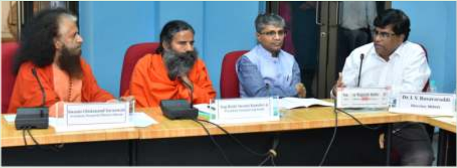
Steering Committee meeting of YCB